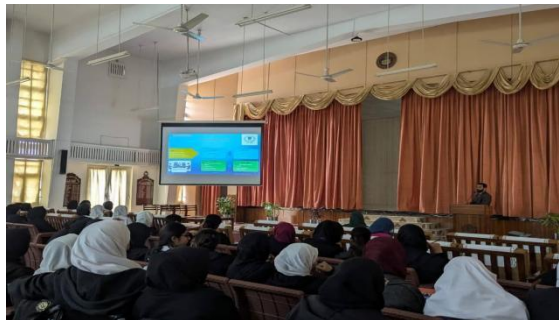
Career Counseling by Mannabi Business School