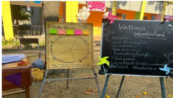
Mental Health Awareness Fest