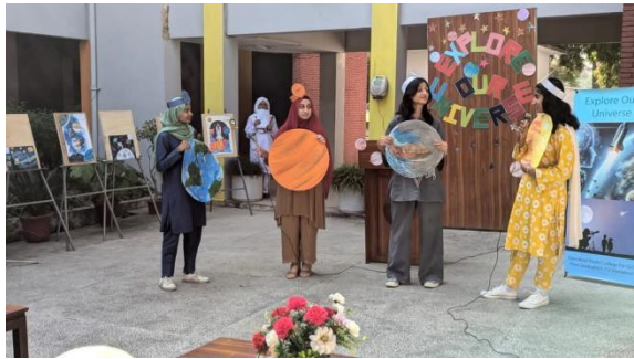
Exploring the Universe