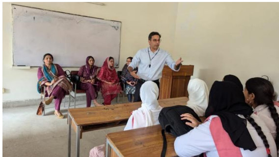
Financial Literacy by NIBAF & SECP