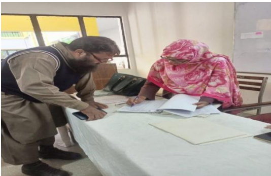
Parent Teacher Meeting