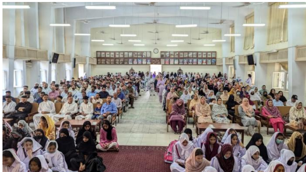
Orientation Ceremony Session 2024-25